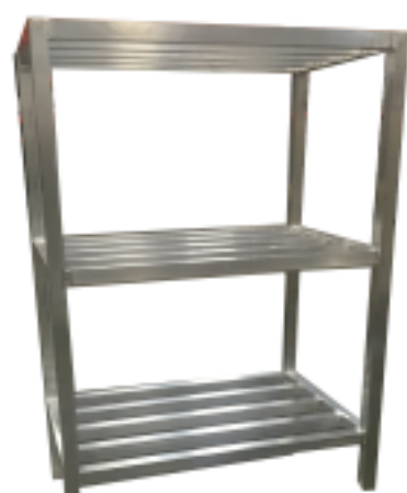
JM-AL-BCS-2448-3 *All Welded pictured